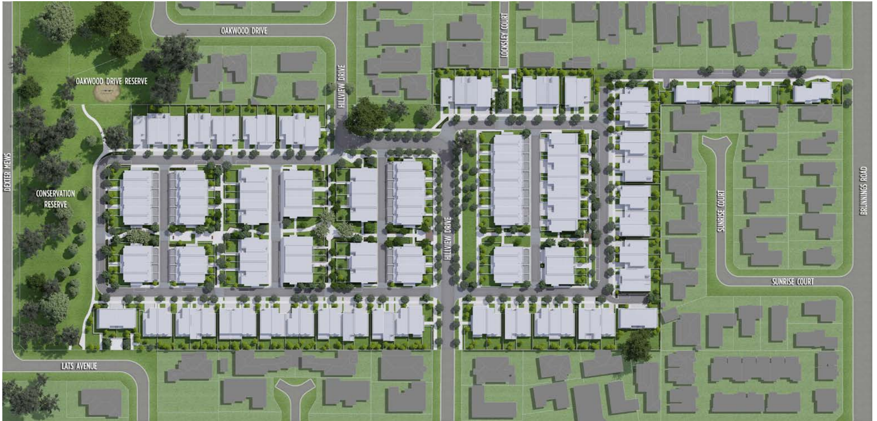
Artist's impression. Map is computer generated and not to scale. All information is subject to change without notice.