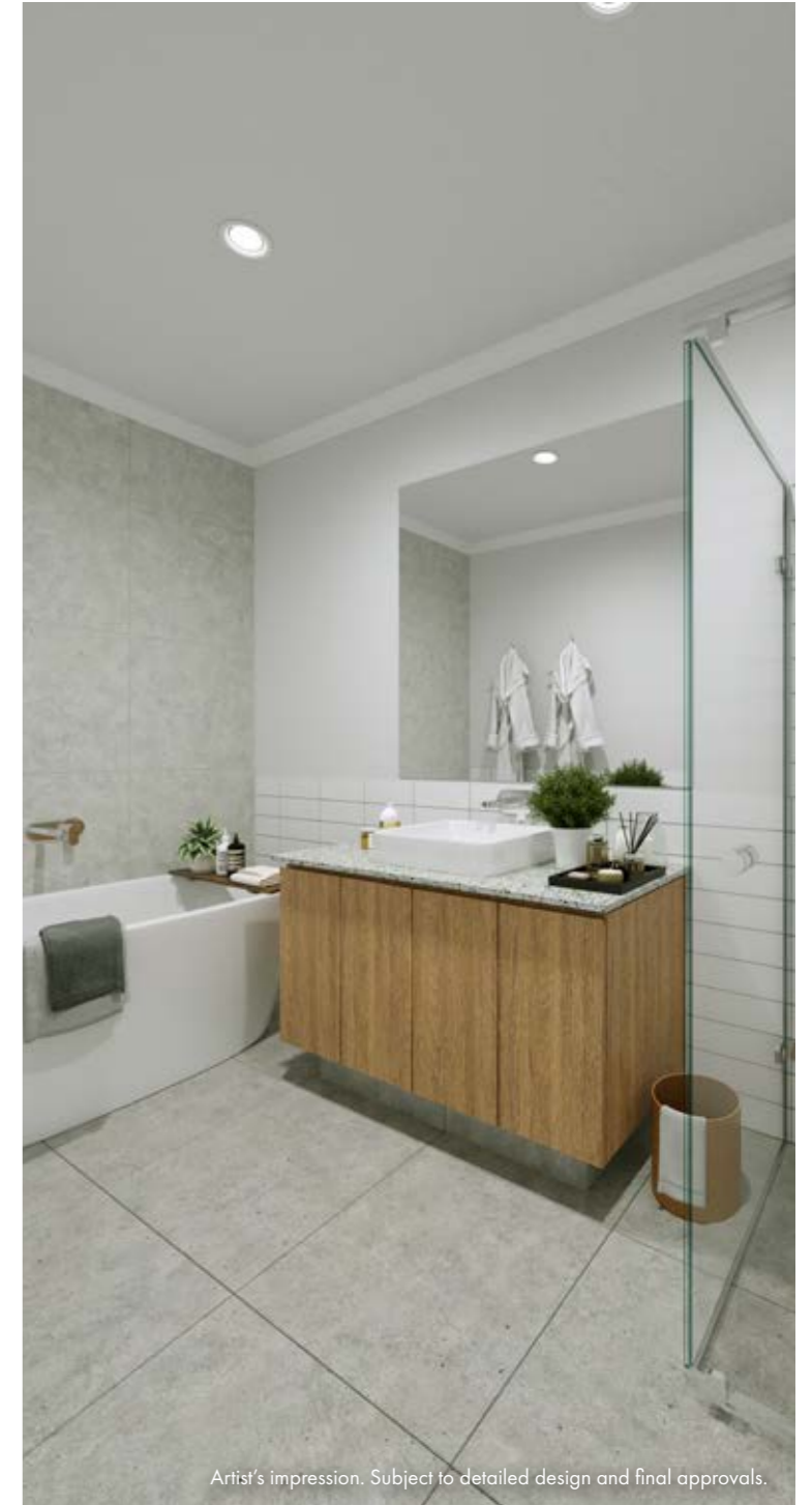
Artist's impression. Subject to detailed design and final approvals.

At Sandford we believe that when you buy a new home everything should come included. What we consider to be standard features in our homes, often come as an extra cost elsewhere. You'll love the stylish timber floors and sleek stone benchtops bathed in gentle light. High ceilings and generous bedrooms will give your home a wonderful sense of lightness and space. You'll also love the touches of luxury like the freestanding baths, the quality appliances and the choice of three internal colour schemes created by our interior design team.