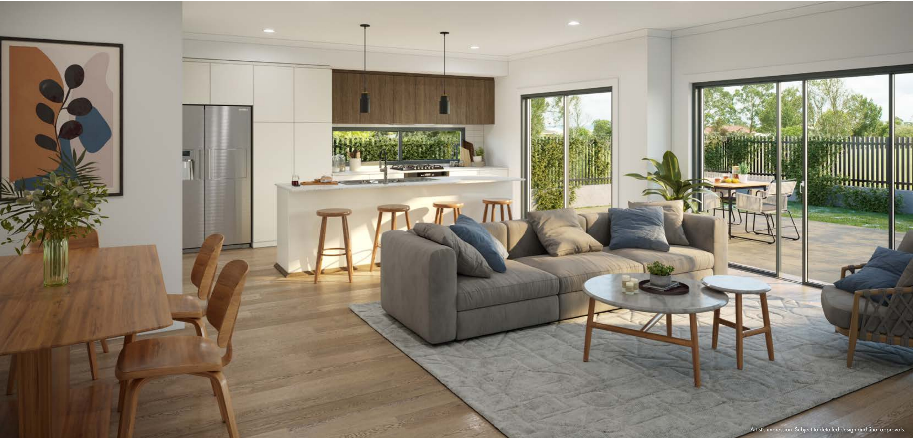
Artist's impression. Subject to detailed design and final approvals.