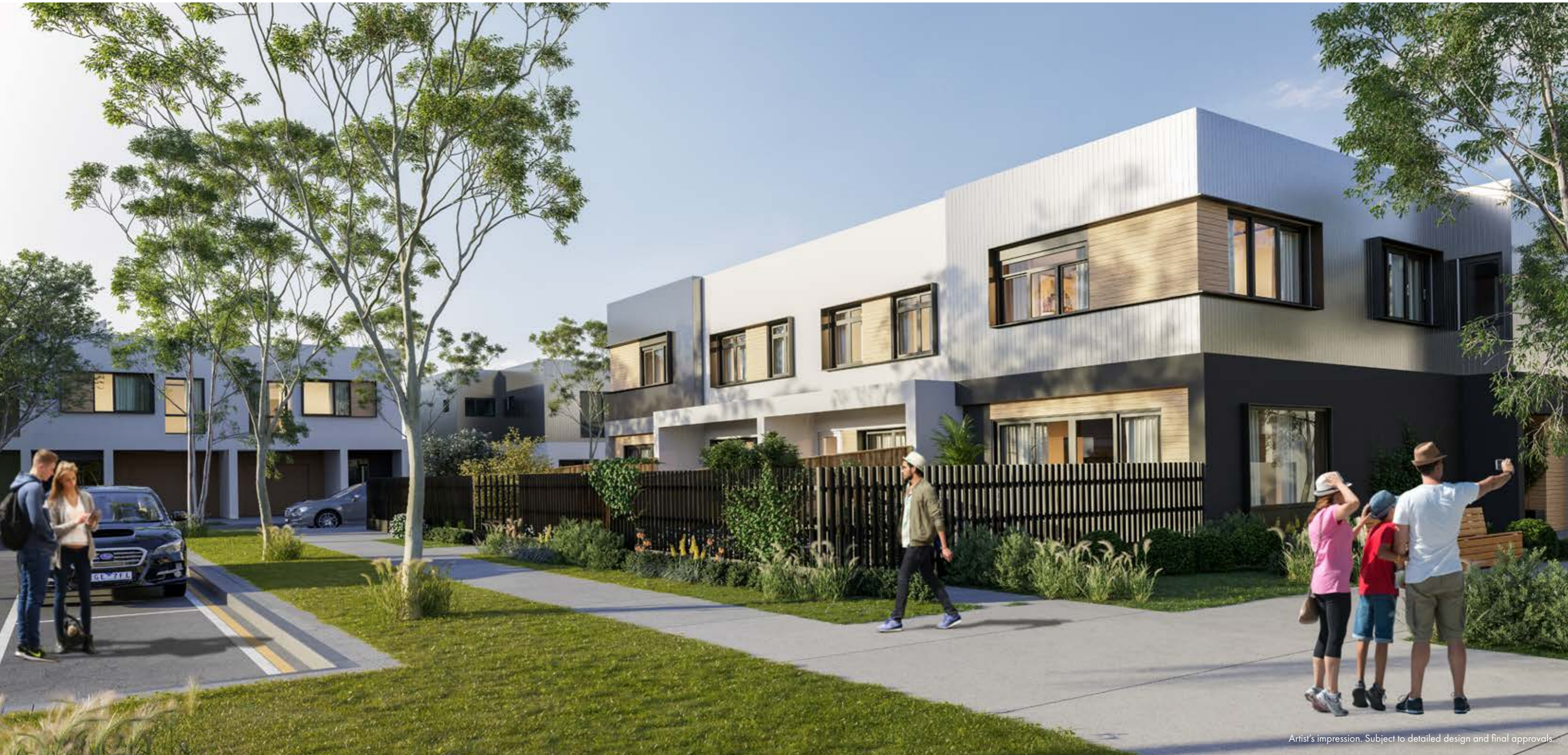
Artist's impression. Subject to detailed design and final approvals.