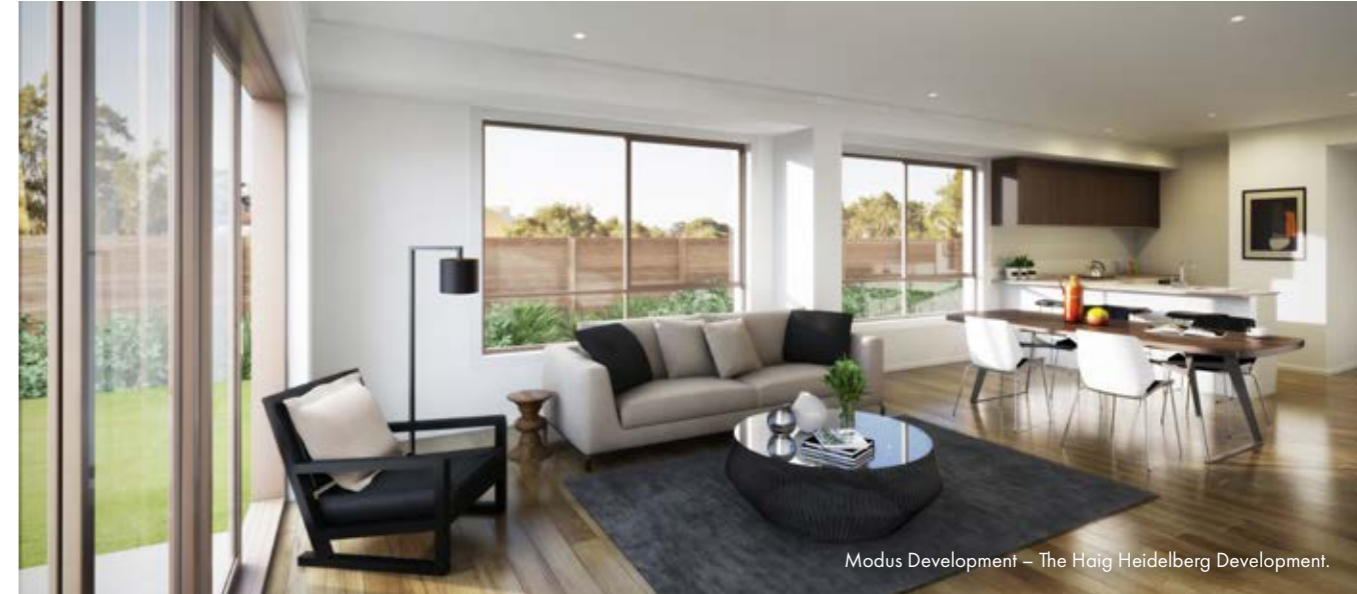
Modus Development – The Haig Heidelberg Development.