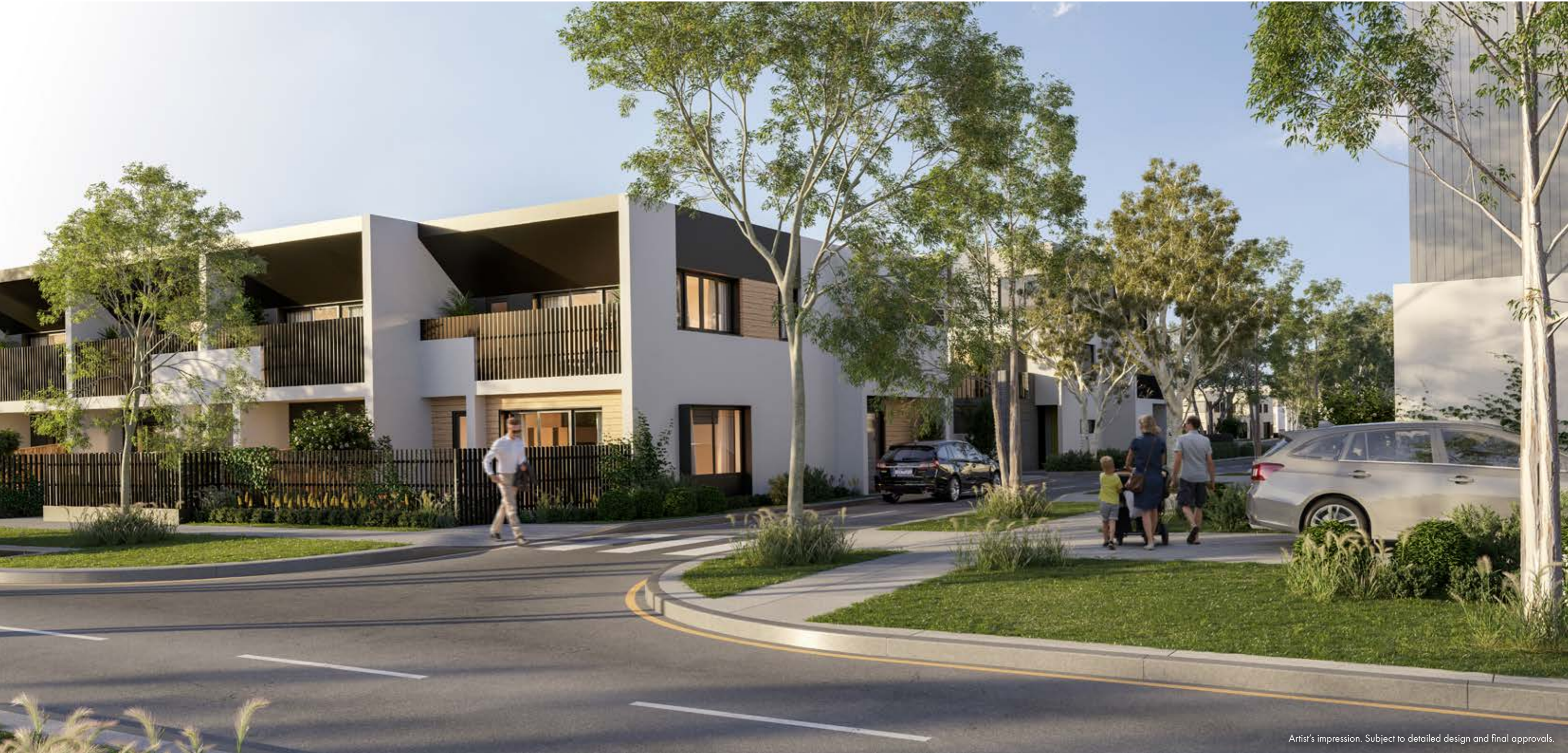
Artist's impression. Subject to detailed design and final approvals.