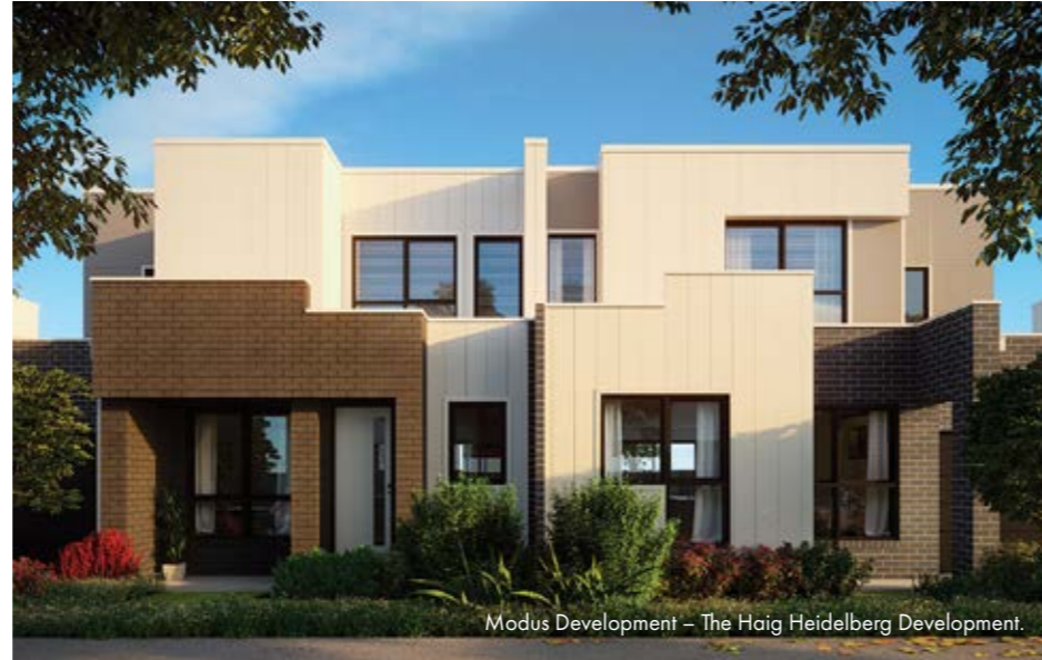
Modus Development – The Haig Heidelberg Development.

Modus Unique Developments is the trusted name behind residential projects marked by a high degree of liveability and exceptional quality. Led by three directors with more than 120 years of combined experience, the entire team is driven by a vision to create new homes and new communities which deliver superb lifestyle choices, each in carefully selected locations. Known for in-fill masterplanned projects which add to the fabric of local communities, Modus Unique Developments works with selected partners to ensure its vision is realised, and will provide enduring value for purchasers.