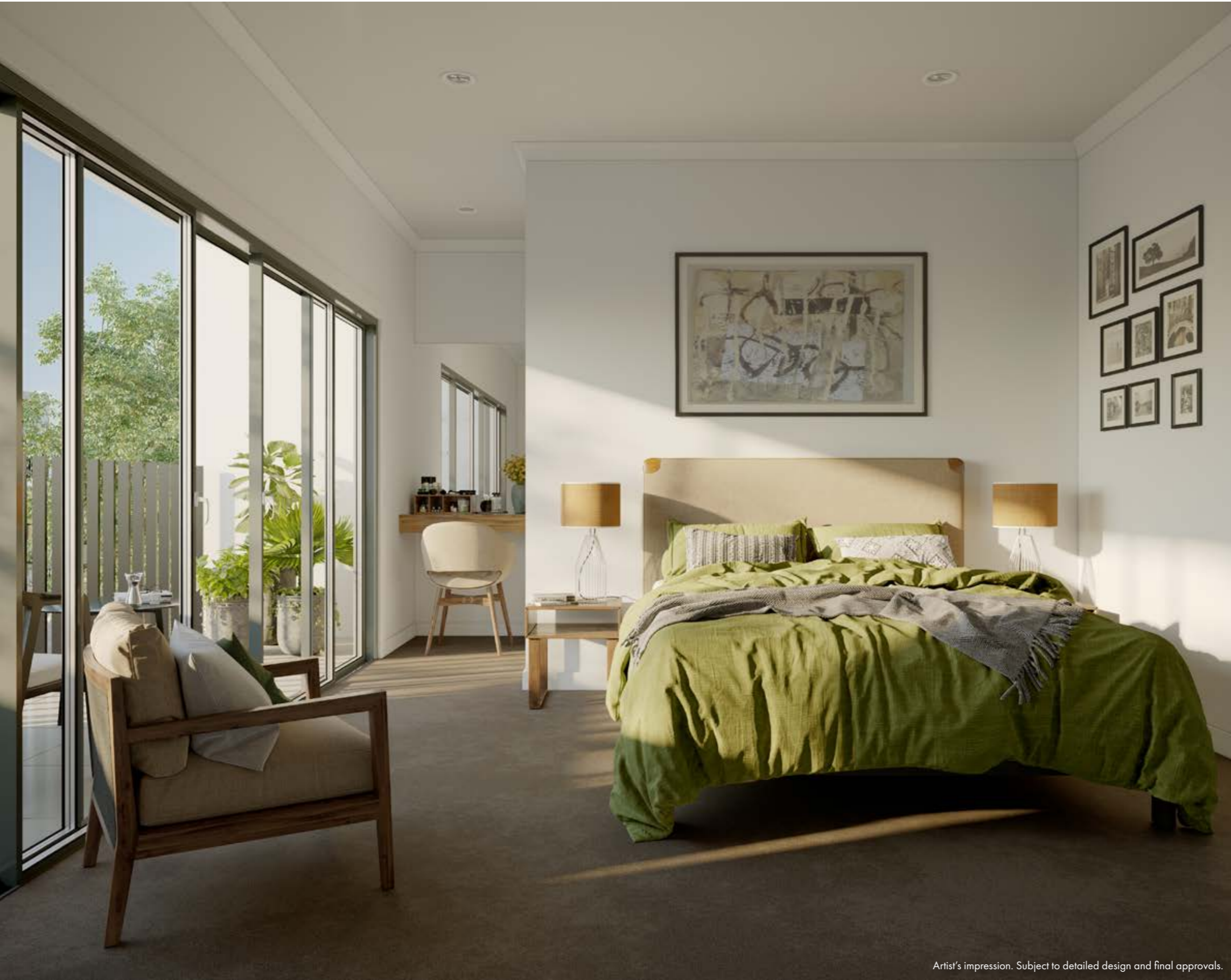
Artist's impression. Subject to detailed design and final approvals.